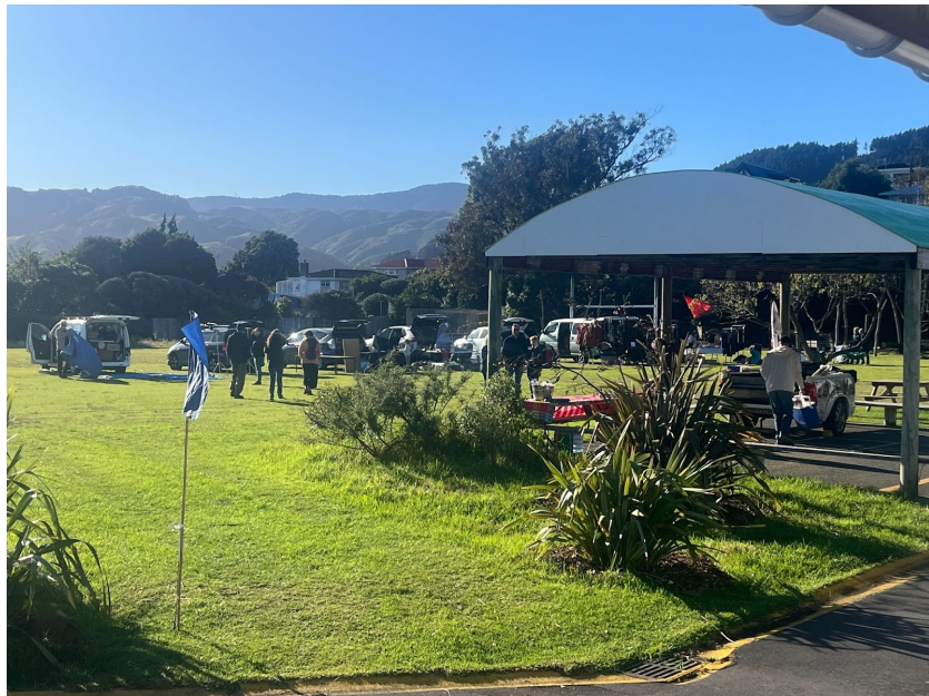
Getting set up for a great day

The Mother's Day Plant Sale and Carboot Market was a big success and helped us get closer to completing the playground.