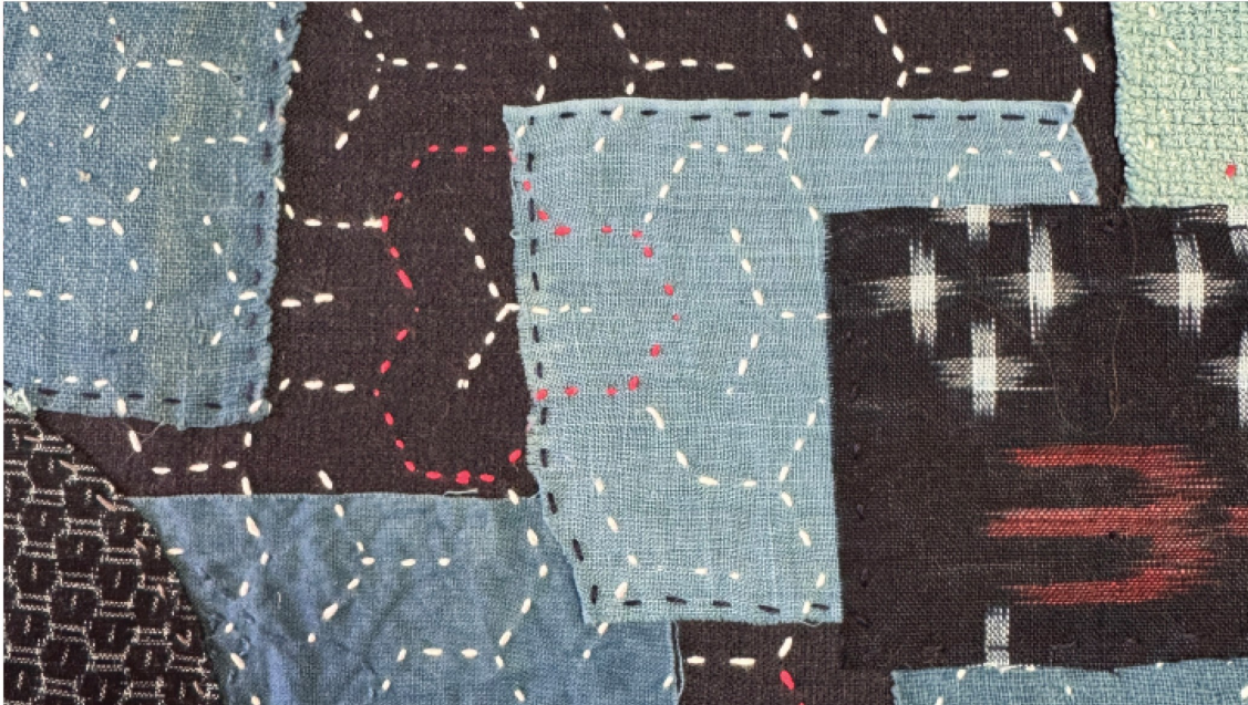
above: Deb Donnelly detail of boro and sashiko swatches on a cushion cover