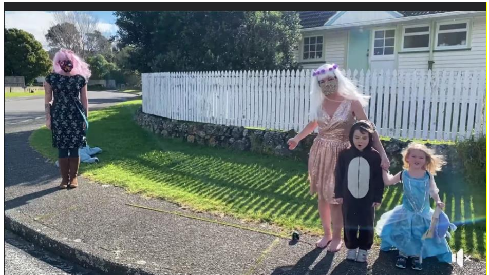
Tuakana Birthday Video

Did you know... Despite being locked down, the kaiako of Paekākāriki kura won't let special days pass by without some sparkles! See below some special 'lockdown birthday' shots for our tamariki.