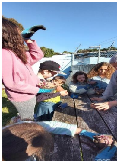
Ngā Purapura – kumara experiments