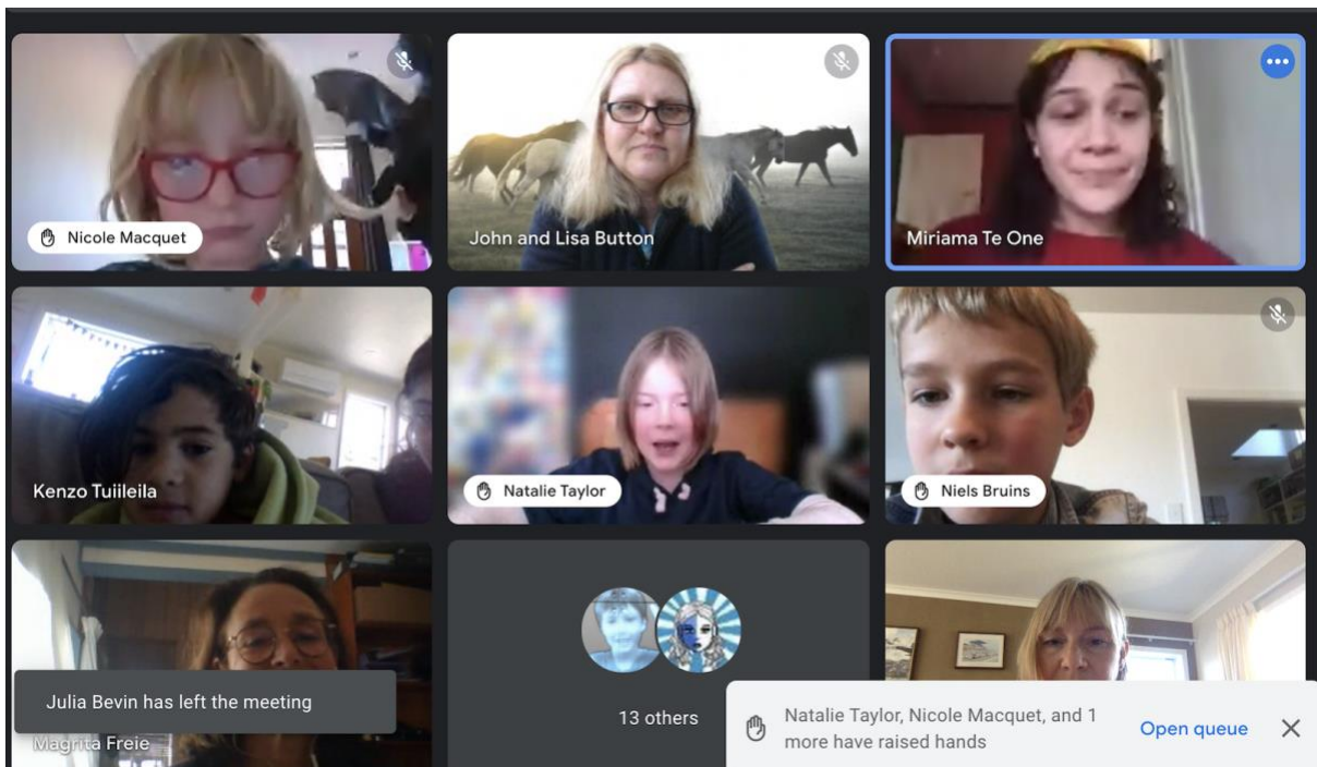
Ngā Kākano hangouts