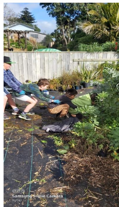
Ngā kākano – This is how we group weed 😊