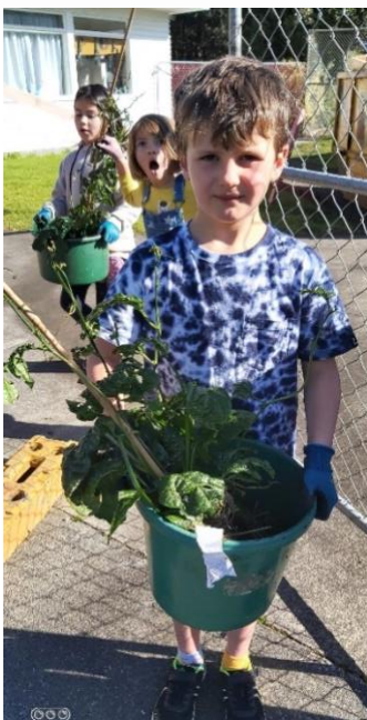
Ngā Kākano moving Passionfruit

We have again been extremely impressed with the agentic learning being displayed by a large number of our tamariki during this time of Distance Learning. The seamless way that students have transitioned between onsite learning and distance learning demonstrates our students are already operating a high level of autonomy in their every day play and structured learning.