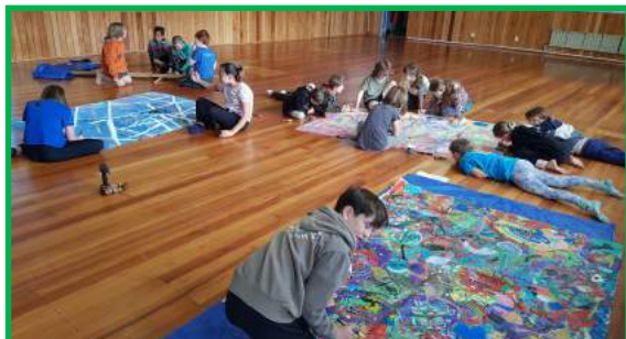
Painting the canvas.