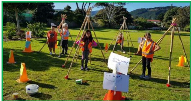
Setting the frames in concrete